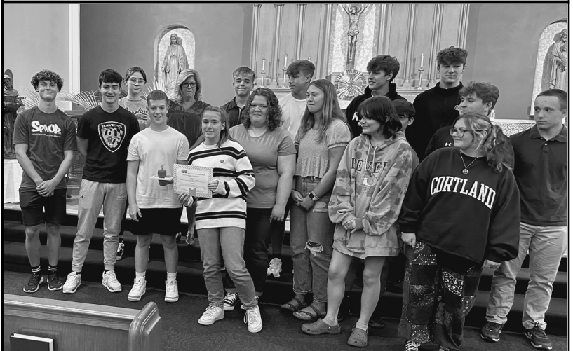
Our 2023 Confirmation Candidates received the Diocesan Green Apple Award for their outstanding service project based on Laudato Si.