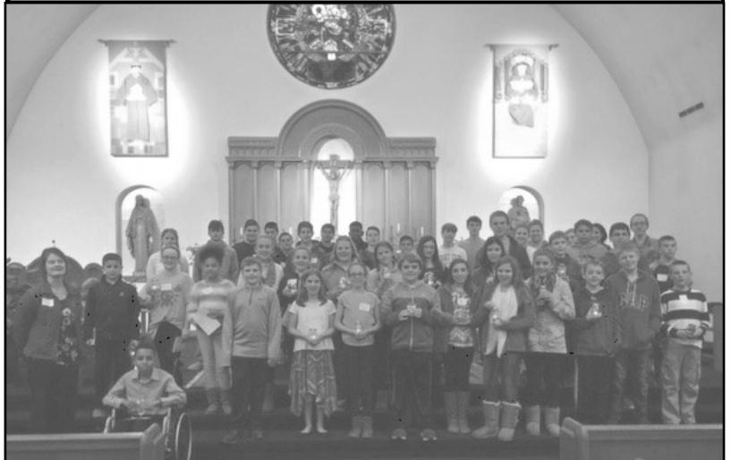
Ending Prayer at 6th Grade retreat with St. Mary's and St. Paul's

No Faith Formation next weekend November 13th, Veteran's Day Holiday. November 20th at 10:00a.m. in the church, classes will participate in an End of the Holy Year of Mercy Prayer Service. Parents are welcome to join us in the church for the Prayer Service. Classes will return to the school for dismissal.